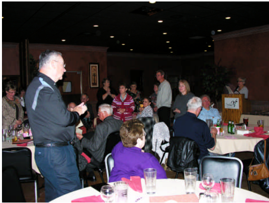
Awards recipients standing (only half of room)

Michael V's was the setting for the 2010 TDTC Awards Banquet. Participants enjoyed a wonderful buffet meal with luscious desserts (I'm pretty sure the sugar might have perked up those attendees who had been at the Agility Trial earlier in the day).